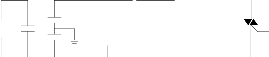
FIG.8 Test circuit for inductive and resistive loads to IEC-61000-4-5 standards