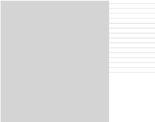
FIG.7: Relative variations of gate trigger current, holding current and latching current versus junction temperature