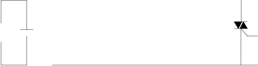
FIG.7 Test circuit for inductive and resistive loads to IEC-61000-4-5 standards