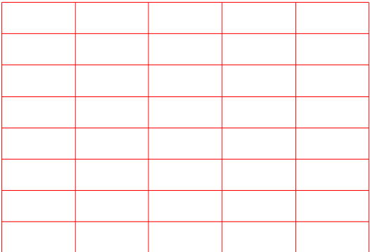
FIG.1: Maximum power dissipation versus RMS on-state current