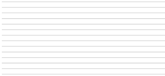
FIG.1: Maximum power dissipation versus RMS on-state current