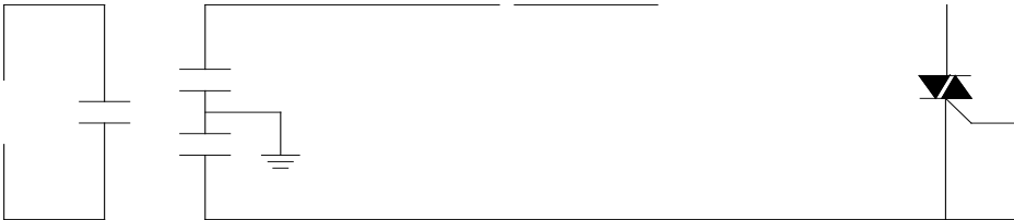
FIG.8 ÖTest circuit for inductive and resistive loads to IEC-61000-4-5 standards